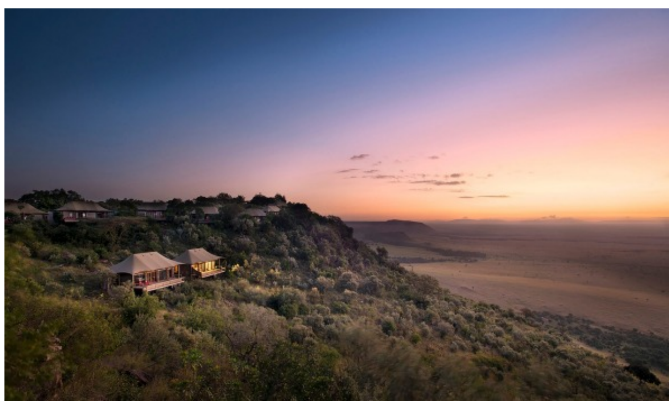
Wake up to Kenya's Great Rift Valley: the gobsmacking view from Angama Mara. '