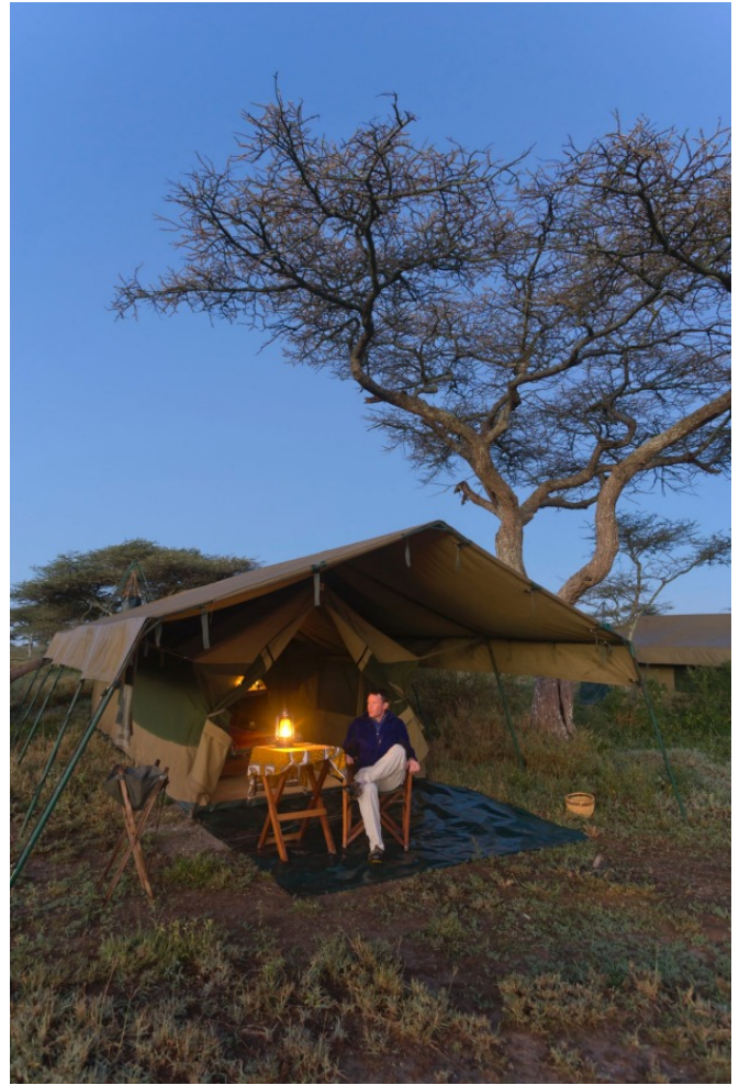
Glamping it up in the Serengeti National Park, Tanzania

Camping in Tanzania's mighty Serengeti: Pop over the border from Kenya to get up close and personal with half a million wildebeest. There are great camping operators who will glamp you up a storm. Nicky Fitzgerald