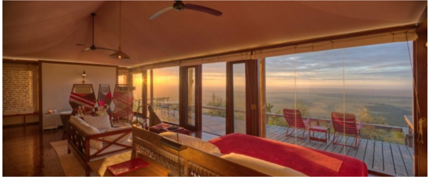
The view from Angama Mara.

Said hurdles have included baboons trashing a pantry, lodges washed away by El Niño, finding a cobra in the bottom of a guest's loo, and leaving a diving guest at sea ("thankfully immediately rescued by another dive boat – not our proudest moment").