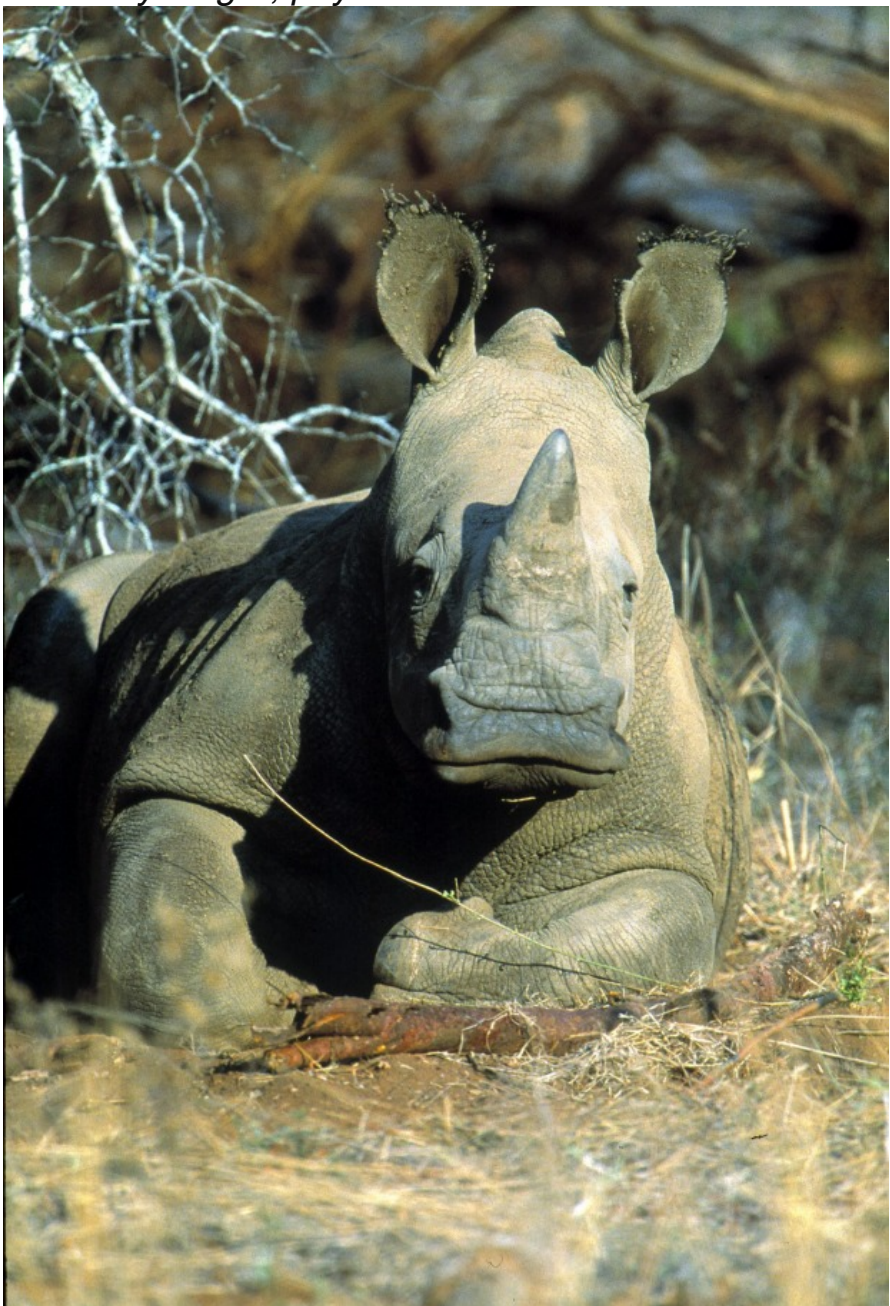
To prevent poaching, Rhinos Without Borders are relocating 100 rhinos from South Africa to Botswana.

Abercrombie & Kent are also in deal mode: book their 10-day luxury Out of Africa journey (priced from $18,640 per person) and receive a free hot-air balloon ride over the Maasai Mara and an extra night free at Angama Mara. Meanwhile, Sanctuary Retreats' flagship Chief's Camp property in Botswana – refurbished last year – also has "stay longer, pay less" deals.